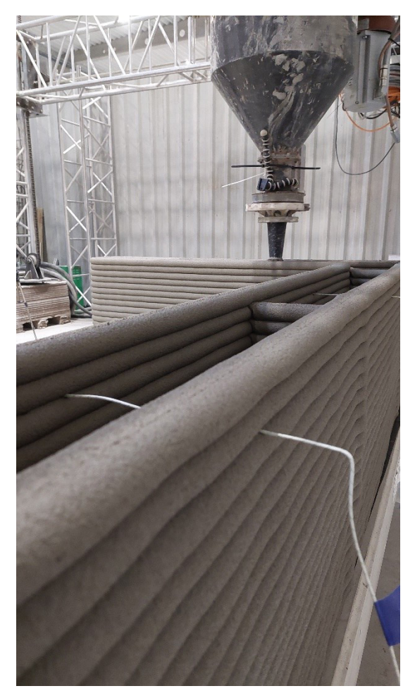
Fig. 4. Printing of houses (reinforcement and thermocouples are visible)

During printing, thermocouples were inserted between the selected layers for temperature measurements. In total, 40 thermocouples were inserted into each house.