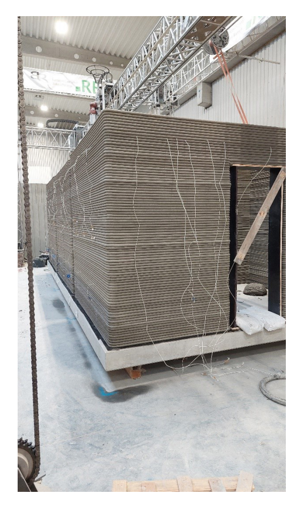
Fig. 5. Final effects