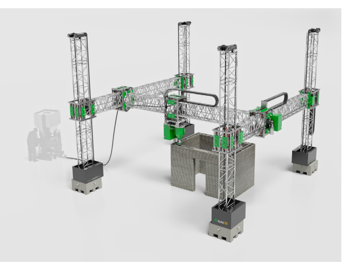
Fig. 3. Computer model of printer