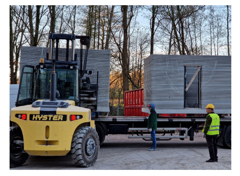
Fig. 6. Transport of the houses

creased the mean output of the mixture. The concrete mixture was prepared especially for the needs of 3D printing by ATLAS company. The discussed houses had a door opening, the printed reinforced lintel and wall pillar; they did not have a roof. The walls had the thickness of 240 mm and, depending on the site they consisted only of outline or outline with filling in a shape of Z let-