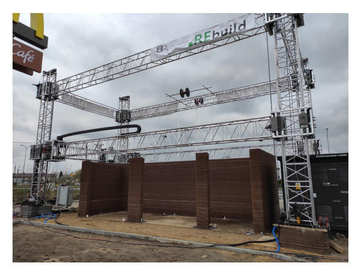
Fig. 2. Printer Rebuild v3. Real view from the first building site of this type in Poland, with the application of concrete in 3D printing