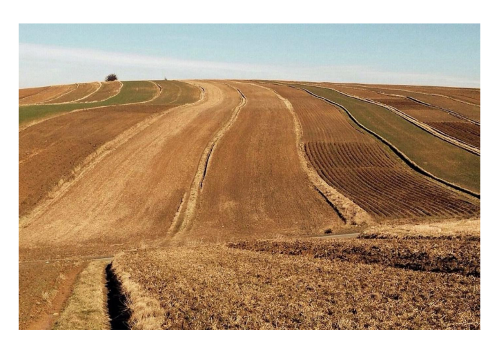
Fig. 4. Typical small Polish farms in Świętokrzyskie region

Desertification means "the degradation of the land in arid and semi-arid regions due to a variety of factors, including climate variability and human activity". This phenomenon can lead to poverty, serious health problems due to wind-blown dust, and