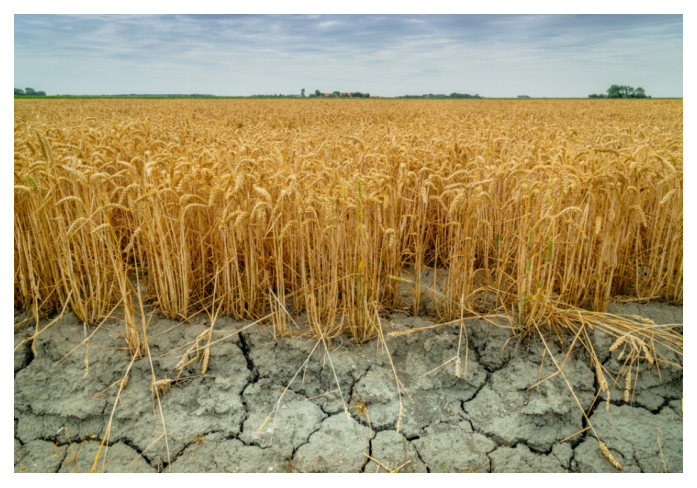
Fig. 6. Grain just before harvest in central Poland, in an area affected by drought

Soil remediation allows greenhouse gases to be gradually absorbed from the atmosphere, allowing trees and vegetation to grow. These plants, in turn, can absorb greater amounts of carbon dioxide. In areas where soil has been degraded, these processes do not take place and carbon dioxide is not absorbed from the atmosphere.