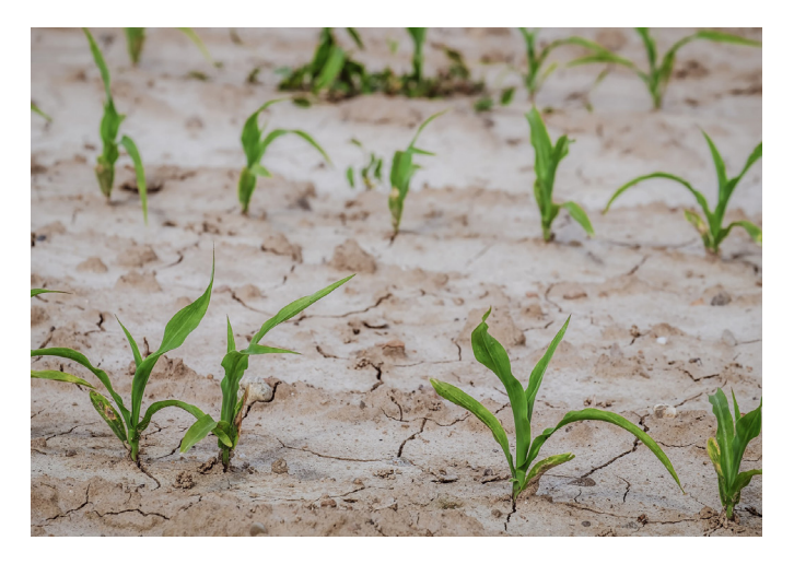
Fig. 5. Inhibition of the growth and development of maize seedlings in conditions of water scarcity

If droughts last for months or years, they can affect huge areas and have serious economic, social and environmental impacts. While droughts have always occurred, their frequency and impact have increased as a result of climate change and human activities that are not adapted to local climatic conditions.