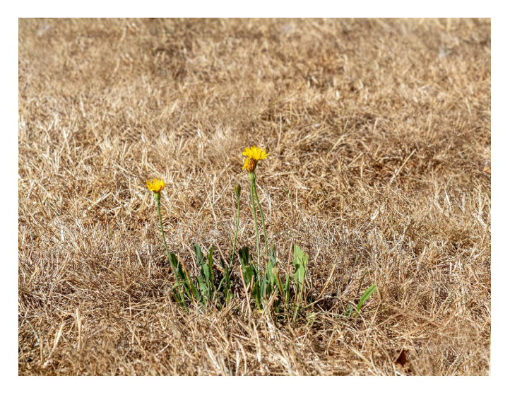
Fig. 3. Dried grass during dry season

products due to the urgent need to replace fossil fuels and prevent greenhouse gas emissions.