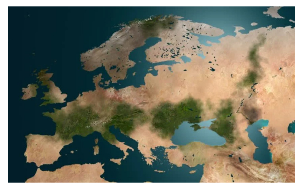
Fig. 1. The structure of the land surface of European countries in terms of water abundance (light color, tendency to desertification — low water supply in the ground)

southern Italy, Bulgaria, Romania, Central European countries, including Poland and northern European countries. The UN General Assembly in 1995 established June 17 as the World Day to Combat Desertification and Drought.