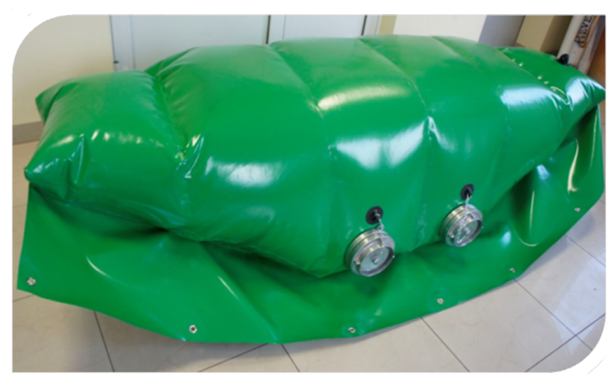
Fig. 3. The threshold apron in the upper stand