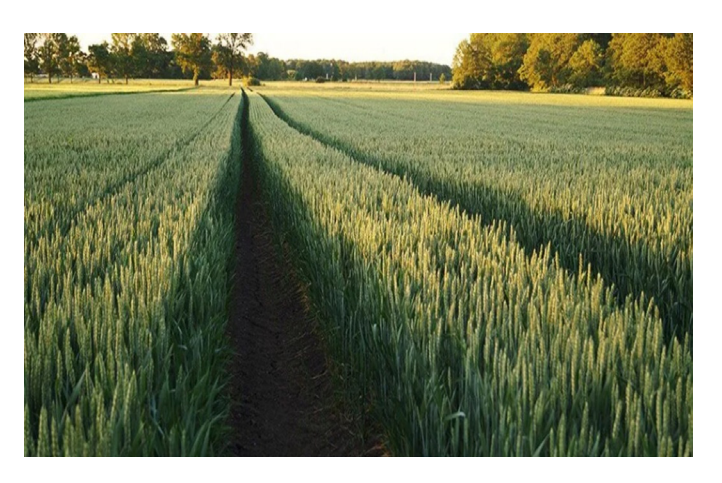
Fig. 2. Cereal fungicides ensure the effective cereal disease control and result in crops of a good quality

As it was reported by USDA, the world market of wheat production is dominated by the following countries: EU (150.969 million tons), China (126 million tons); India (95 850 million tons);